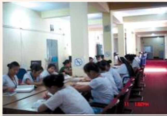
View of the Central Library