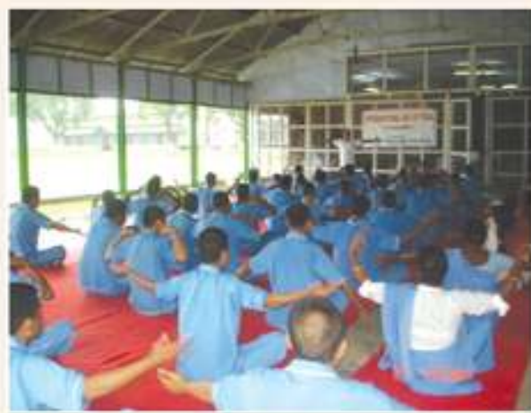
Observation of International Yoga Day