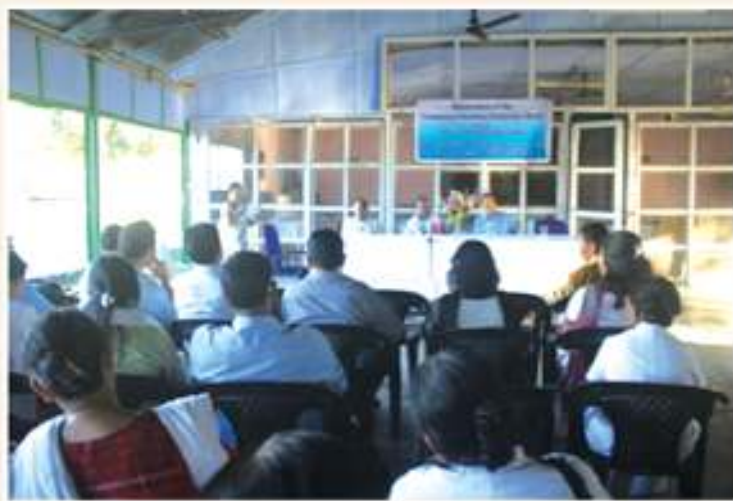
Observation of Communal Harmony Campaign Week from 19th to 25th November, 2015