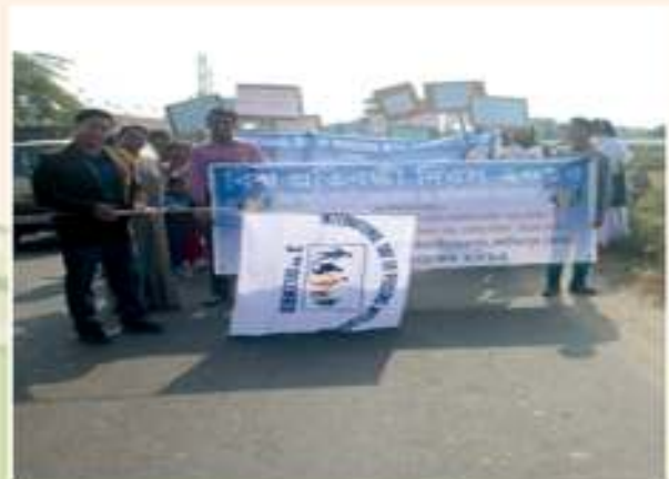
Rally passing through the city on the occasion of International Day of Persons with Disability