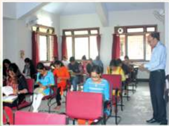
Entrance examination held on 06.03.16

Online system has been adopted for submission of applications for the three courses, namely M.Sc. Nursing (Psychiatric Nursing), M. Phil in Clinical Psychology and M. Phil in Psychiatric Social Work. The entrance examination was conducted centrally at the institute campus on 8th March, 2015. A total number of 170 forms have been submitted online out of which 165 students were selected to appear in the exam and 119 students actually appeared in the exam.