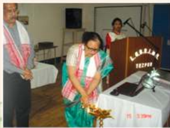
Observance of world social work day on 15.03.16