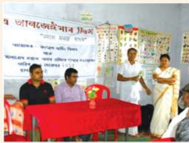
Observance of World Alzheimer's Day