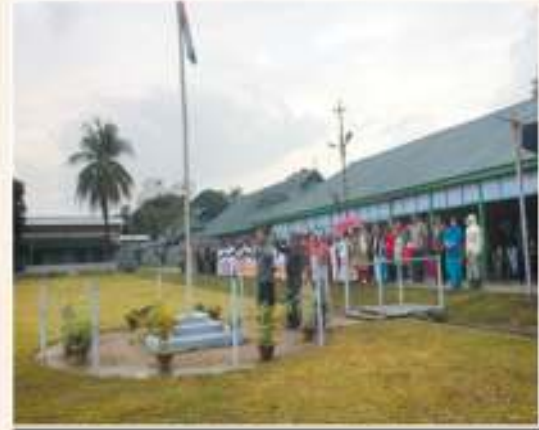
The Director addressing the audience on the occasion of Republic Day.