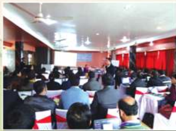
Workshop on “Use of Statistical Tools in Biomedical Research” on 21st January, 2016