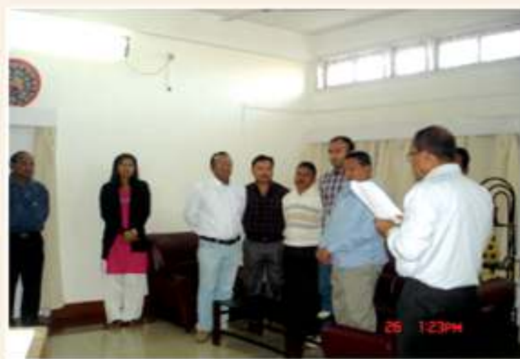
Staff taking pledge on the occasion of Constitution day observed on 26.11.15