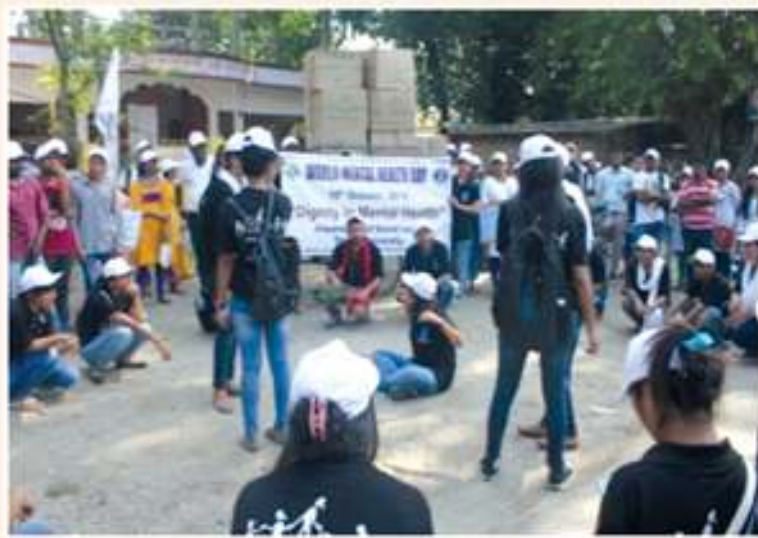
A street play in the midst of the rally