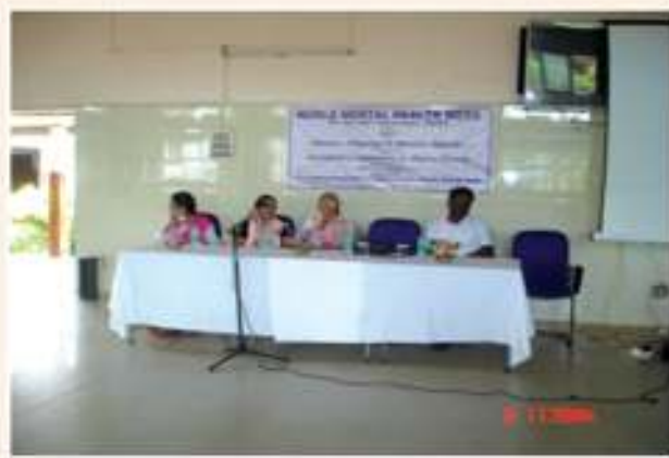
Lecture given on the occasion of World Mental Health Day