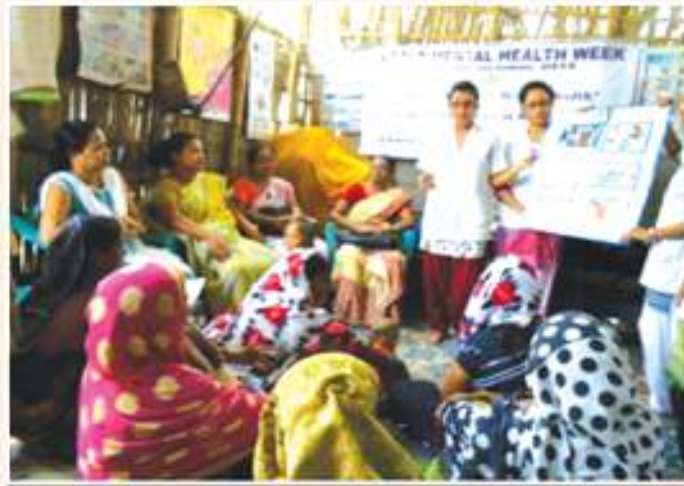
Observance of World Mental Health Week