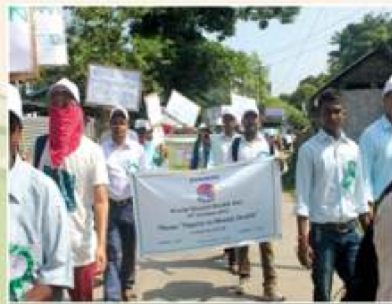
Rally passing through the streets of the city