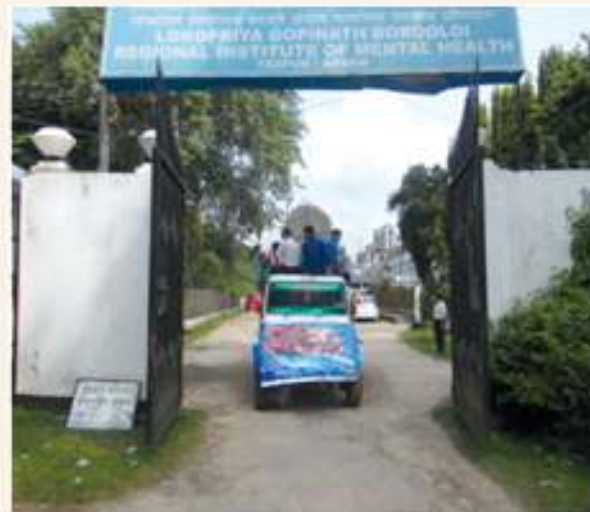
Observance of Durga Puja in Institute premise