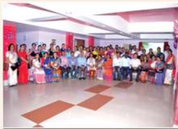
Workshop of "In-Service Training and Sensitization programme for primary school teachers" from 10th to 12th March, 2016