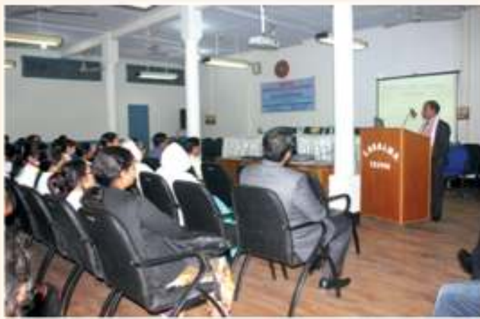
CME on "Nutrition and Cognition function" on 12th January 2016