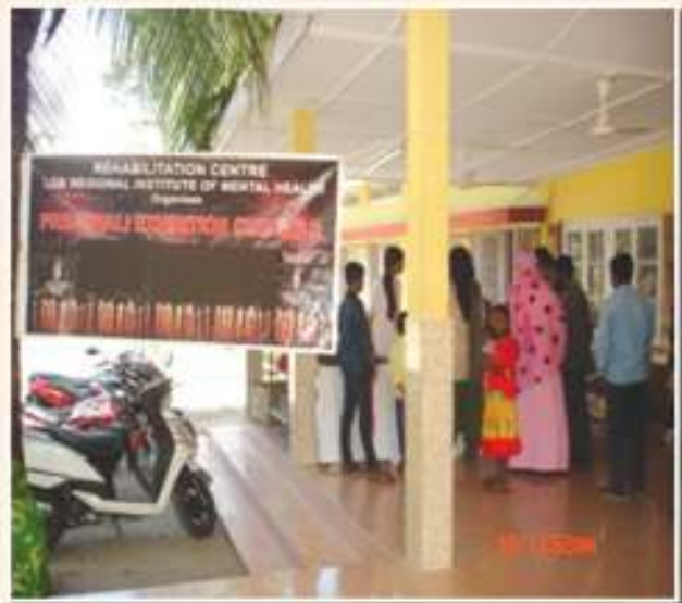
Gym and Exhibition cum Sale of products of Rehabilitation Centre