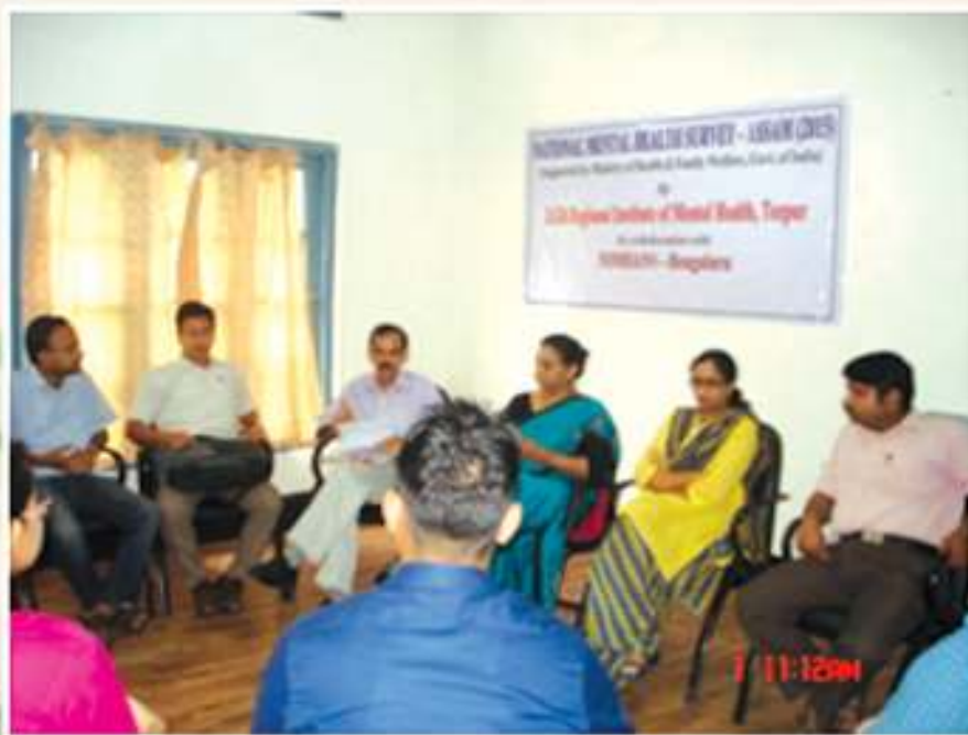
Inauguration of the project National Mental Health Survey, India 2015