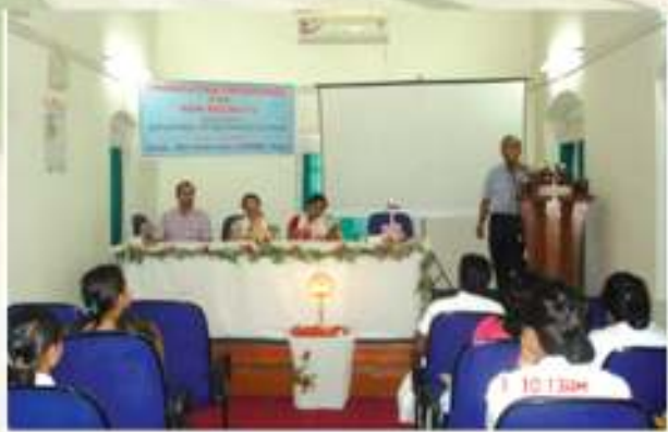
"Orientation programme for newly recruited staff nurse" held on 01.03.16